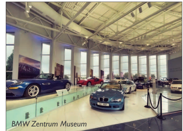
BMW Zentrum Museum