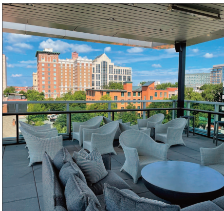
Rooftop Reception at the Avenue