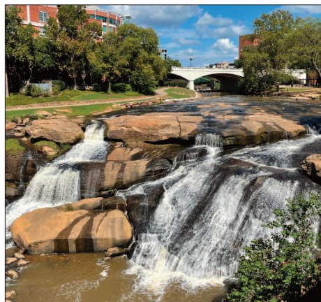
Reedy River Waterfall Downtown Greenville