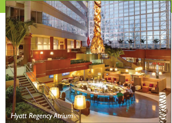
Hyatt Regency Atrium

We look forward to seeing you in Greenville!