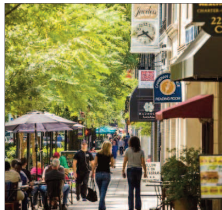
Greenville Shopping & Dining District