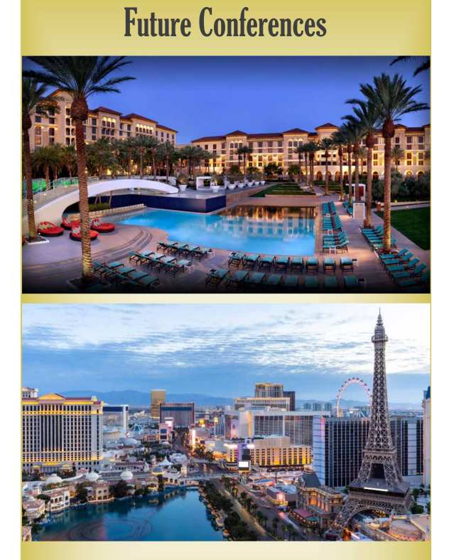
August 7-10, 2022 Green Valley Ranch Resort & Spa Henderson, Nevada

2023 - Utah 2024 - South Carolina 2025 - Illinois